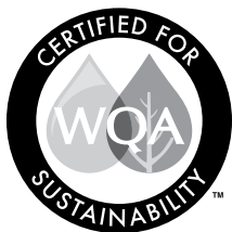
Figure 4-2: WQA's Sustainability Mark.

developed by a WQA task force of environmental experts, consultants, regulators, manufacturers, industry professionals, and other stakeholders.